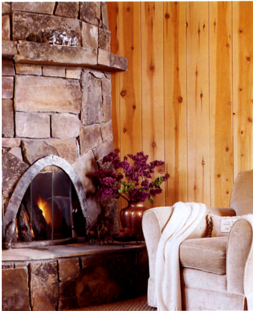
(above) A corner fireplace creates a cozy reading nook in the master bedroom. (right) French doors open onto a balcony with a sweeping view of Lake Tahoe. The headboard, built on-site, was a surprise gift from the builders.

But before any craftsmanship could be applied to the house, Guzzi had to solve the considerable design problem of creating access to the building site. "Making the driveway work was a major challenge," she says.